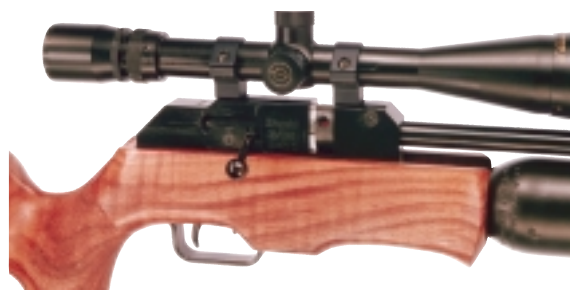
The 7 shot magazine loaded into the right hand side and bolt locked in the open position. NOTE; the 12 and 17 shot magazines load in from the left hand side.