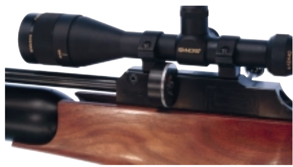
The 12 and 17 shot magazines fit in from the left hand side of the rifle. Make sure the magazine clears the scope turrets.

The Theoben scope mount system is second to none. The mounts locate and bolt directly onto the body. Once a scope is zeroed in, no further adjustments are necessary. The mounts are suitable for up to 45mm scopes. Adaptor blocks can be used for larger scopes. Avoid over-tightening of top halves of mounts otherwise damage may occur.